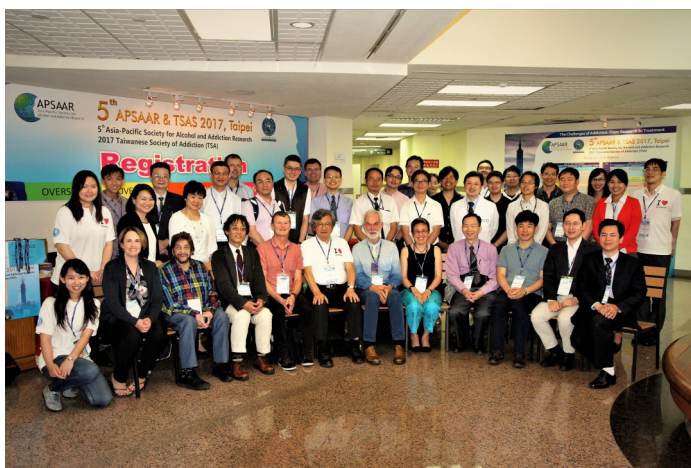
Group photo at Tri-Service General Hospital

Schedule Program; for more information please visit APSAAR-TSA 2017