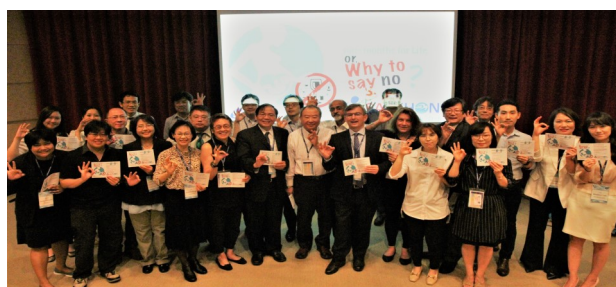
Group photo in the auditorium of Tri-Service General Hospital

Cutting-edge technology and research have been developed to minimize the problems that arise from drug abuse. Despite these developments, we have encountered many new challenges in the war on drugs. For the challenges outlined above, we invited academic scholars and experts from the Asia-Pacific and other regions share the latest biomedical, epidemiological, judicial, and educational research and experience on substance abuse. The 6 th APSAAR conference will likely be held in Kuala Lumpur, Malaysia.