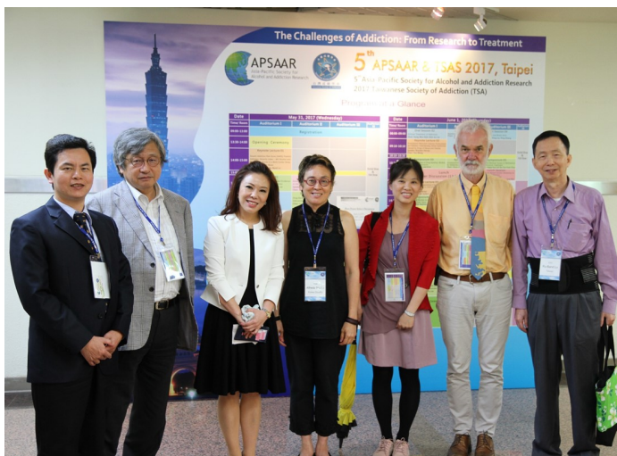
Group photo of APSAAR-TSA 2017

For more active highlights, please visit :